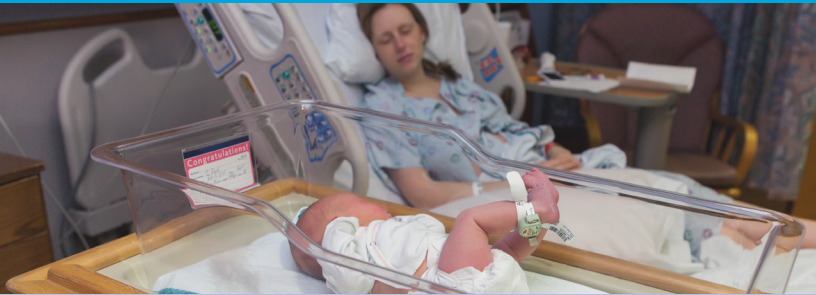
Keep Baby Close