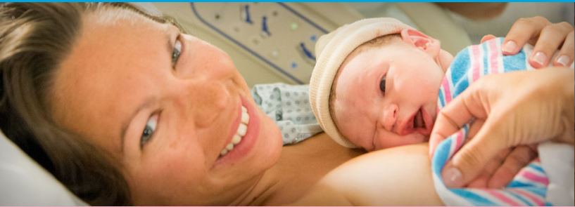
Fall In Love

When the magic day comes, Mother Nature will do most of the work for you. Follow these simple tips to help you and your baby get off to a great start!