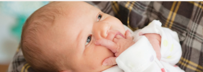
Learn Your Baby